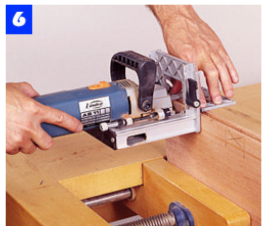
6 Mark the plate centers on the front and back bottom rails and cut the slots. Use the joiner fence to locate slot heights.

Next, lay out the slots on the edges and ends of the bottom shelf and cut them. Use a flat tabletop as a registration surface for locating the slots. Be sure that you hold both the joiner and workpiece tight to the table when cutting. Use the same technique to cut the slots in the top ends of the case sides as well as the top edges of front and back upper rails. Mark the case sides to indicate the positions of the slots for the bottom shelf joint, then cut those slots (Photo 7). Clamp a guide