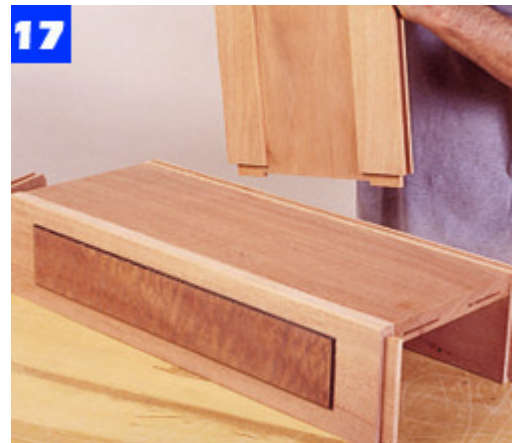
17 Slide the center back panel between the two stiles. Apply glue and join the stiles to the top and bottom back rails.