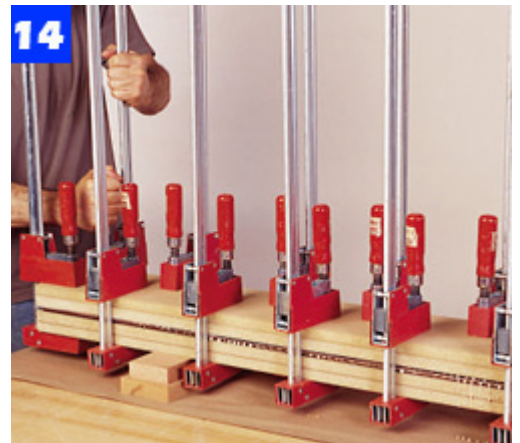
Stack the side panels with wax paper between each piece and plywood cauls on top and bottom. Then apply clamps.