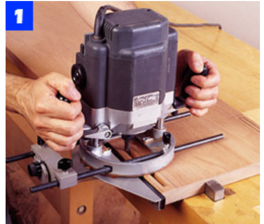
Use a spiral up-cutting bit to rout the mortises in the case sides. Reach full depth in two or three passes.

Use a dado blade in your table saw to cut the tenon cheeks on the rails and stiles (Photo 4). A stopblock clamped to the saw table ensures that all tenons will be the same length. Since most dado blades leave small ridges on the surface of the stock, cut the tenons about 1/32 in. heavy and pare them to size with a sharp chisel. Readjust the blade height to cut the shoulders at the edges of the tenons (Photo 5).