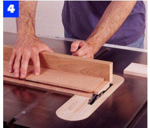
4 Use a dado blade in the table saw to cut the tenons. A stopblock clamped to the table ensures uniform tenon lengths.