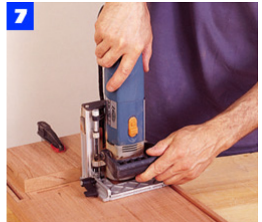
After cutting slots in shelf ends, cut matching slots in case sides. A block clamped to the side locates the joiner.

Bore and countersink screwholes in the case feet. Spread a bit of glue on each foot and fasten them to the bottom ends of the sides with 1-1/2-in. No. 8 screws (Photo 11).