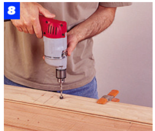
Make a template of the shelf-pin hole locations. Then, use the template to position the holes in the case sides.