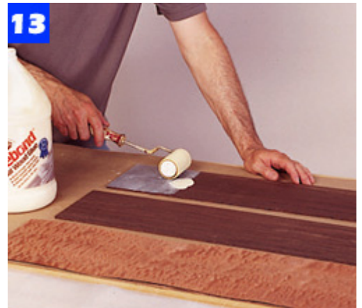
Use a foam roller to spread glue on the wenge strips. Then, place a sheet of veneer on each core panel.

Spread glue on the back of the top-rail panel, place it on the rail and clamp it in position (Photo 15). Use plenty of clamps to ensure a good bond between the panel and rail. Repeat the procedure for bottom rail and side panels.