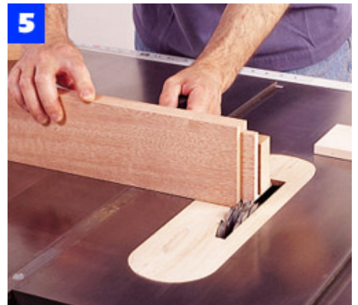
5 Readjust the dado blade height and hold the rails and stiles on edge to cut the tenon shoulders.

Mark the locations of the joining-plate slots on the inner surfaces of the bottom rails and cut the slots (Photo 6). Adjust the joiner fence so that the slots are set back the proper distance from the rail edge. Note that the front rail has four slots while the back rail has three slots.