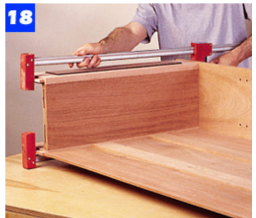
18 Join one case side to the bottom/back subassembly, then add the front top rail followed by the second side.