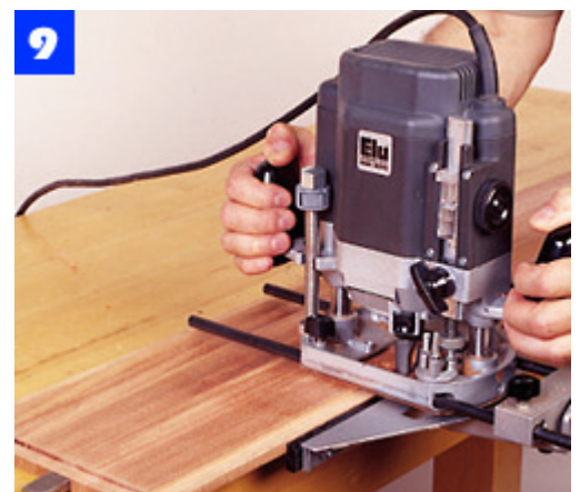
Cut back panels to size from 1/2-in.-thick stock and use a router to shape the rabbet around the panel edges.