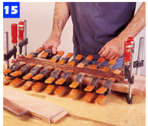
Spread glue on the back of a panel and clamp it to a rail. Use plenty of clamps to ensure a good bond.