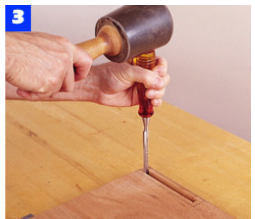
After routing the mortises in the back rails for the stiles, use a sharp chisel to square the ends of all mortises.