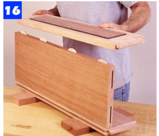
16 Spread glue in the joining-plate slots and on mating edges and plates, then assemble the bottom shelf and rails.

We finished our case with Waterlox Original Sealer/Finish. Apply the finish liberally with a brush or rag and allow it to penetrate for about 30 minutes. Use a lintfree rag to wipe off the excess, leaving only a damp surface. After overnight drying, lightly scuff the surface with 320-grit paper and dust off. Repeat the application using the same method for two or three more coats. When the last coat has cured, rub the surface with 4/0 steel wool followed by a soft cloth.