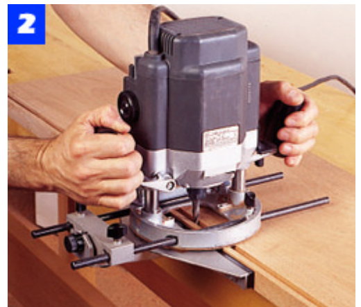
Rout the grooves for rear panels in the case sides. The grooves extend between the mortises for top and bottom rails.